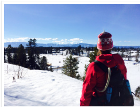
Overlooking the Jug Mountain Ranch nordic center.

Take your honey's hand and savor the last few moments of togetherness before you return home to reality. Thanks to McCall, you've met some great people, shared some new experiences together and discovered the quality time you were seeking (no beach required).