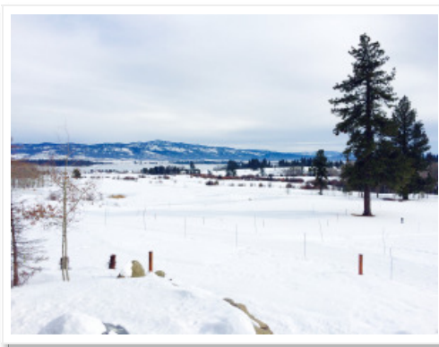
Tamarack Nordic Center

Tamarack's Osprey Meadows golf course offers access to 15 kilometers of groomed Nordic trails with terrain ranging from flat open space along the groomed greens to hillier, wooded areas towards the ski hills. Cozy up après snowshoe in front of the stone fireplace at Seven Devils Pub in Tamarack Village and sip a pint of "Powder Junkie" amber ale from Crooked Fence Brewing Company.