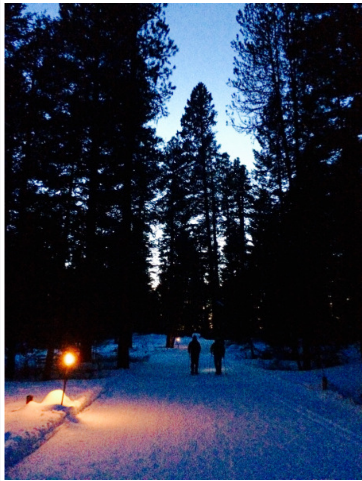
Sunset snowshoe at Ponderosa State Park.

Welcome back! Have you subscribed to our Free newsletter yet? It's a great way to get the latest snowshoeing news delivered directly to your inbox. Don't forget to