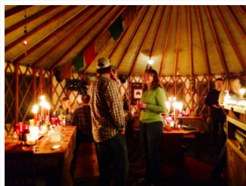
Dinner at the Blue Moon Yurt.

After mingling with your table neighbors for a while, your hostess, Lisa Whisnant, will introduce herself, the staff and the menu before serving the first course: platters of sesame marinated grilled asparagus and a roasted red pepper stuffed brie cheese. The rest of the menu relies on Northwest staples like duck and salmon enhanced with ethnic ingredients like lemongrass, peanut sauce and coconut.