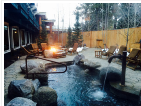
The Cove Spa at Shore Lodge hotel.

Afterwards, enjoy a nourishing bite from the comfort of your lounge chair, like a Pacific Salmon Nicoise Salad or a Northwest Chicken Wrap. Wash it down with a fresh pressed juice or a signature Huckletini, made with local vodka, fresh limes and huckleberries. The staff and surroundings at The Cove make it incredibly hard to leave, but highly anticipated dinner plans with Blue Moon Outfitters will help motivate you to move again.