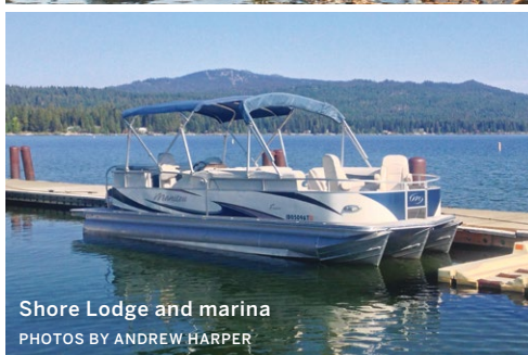
Shore Lodge and marina