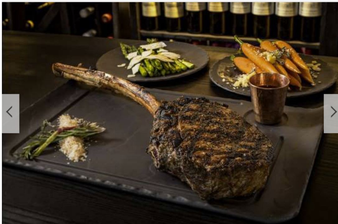
13/51 SLIDES