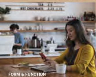
FORM & FUNCTION