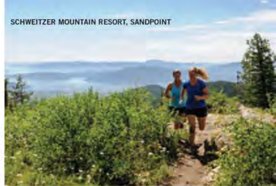
SCHWEITZER MOUNTAIN RESORT, SANDPOINT

In addition, the space houses a fitness facility and guest can enjoy lunch or tea at the spa. Groups can bring the spa to the meeting with a Spa Wellness Break where attendees can indulge in 10-minute restorative meditation and move into a wellness