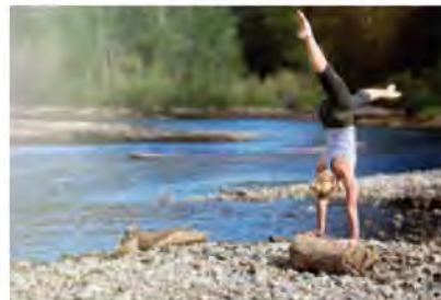
SUN VALLEY RESORT, SUN VALLEY

At Sun Valley Resort, The Spa at Sun Valley features holistic therapies using ancient healing customs from around the world, including acupuncture, cupping and reiki as well as an array of massage and body ritual options. The resort also boasts