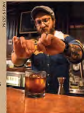
PRESS & POUR