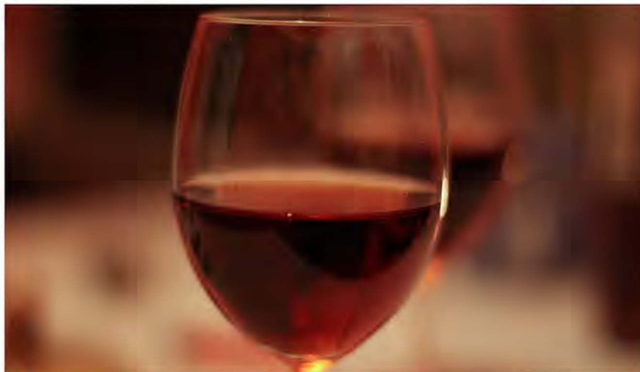
In 2017, eight Idaho restaurants earned Wine Spectator Awards. That number grew by one in 2018.