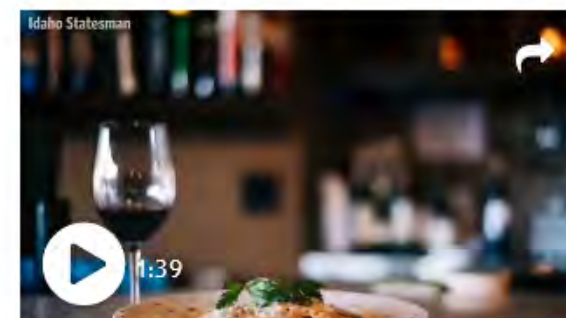
Fort Street Station pub opens in Boise