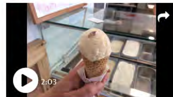
Fresh, creative ingredients at The Stil ice cream shop in Boise